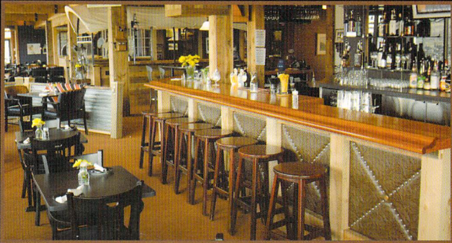
Inside Hoodoos Bar & Grill

The Sun Rivers Clubhouse, home to Hoodoos Bar & Grill, the Proshop, and Banquet Rooms opened in 2005 to amazing reviews. The spectacular view is the perfect setting for weddings, events, tournaments, parties and special occasions. Sun Rivers Golf Resort, an award winning course, is surrounded by a master planned, award winning community. 2000 homes, a resort hotel, town centre and village amenities are set amongst natural beauty and varied recreation.