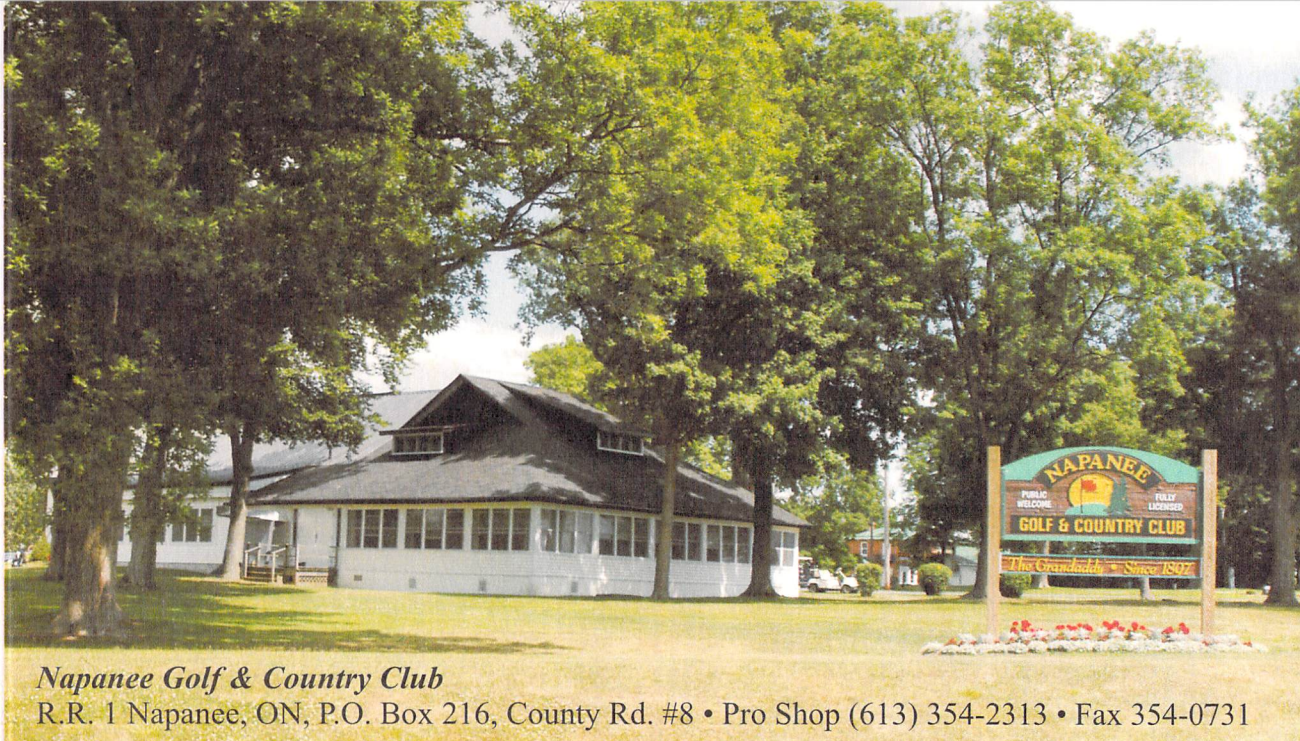
Napanee Golf & Country Club R.R. 1 Napanee, ON, P.O. Box 216, County Rd. #8 • Pro Shop (613) 354-2313 • Fax 354-0731