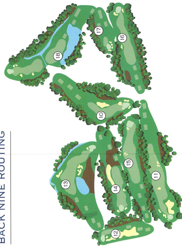
BACK NINE ROUTING